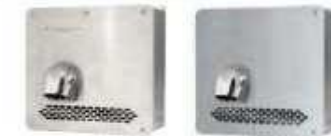
MG88IA (s) EP