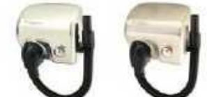
MG88HT (f) LEM MG88HT (s) LEM