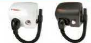
MG88HT (b) LEM MG88HT (a) LEM